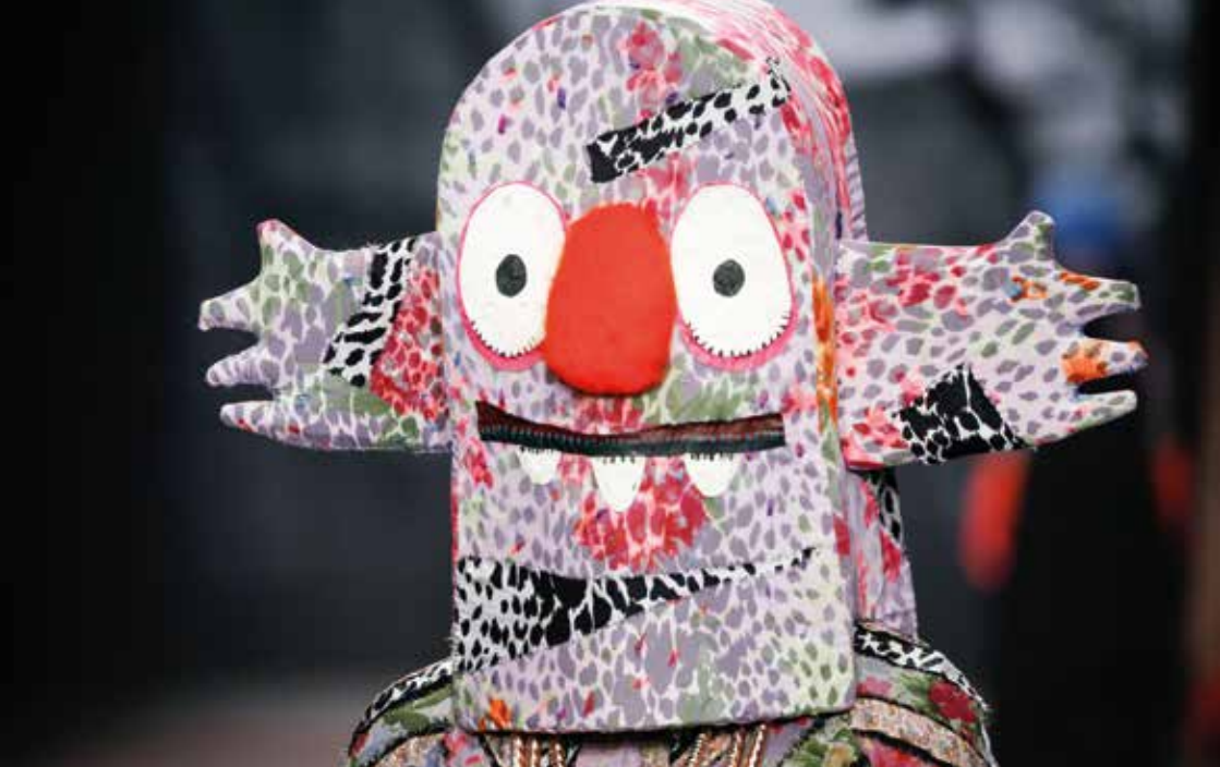
Image: Catwalk Images AFW, Bas Kostas, January 2015, Photo: Peter Stigter