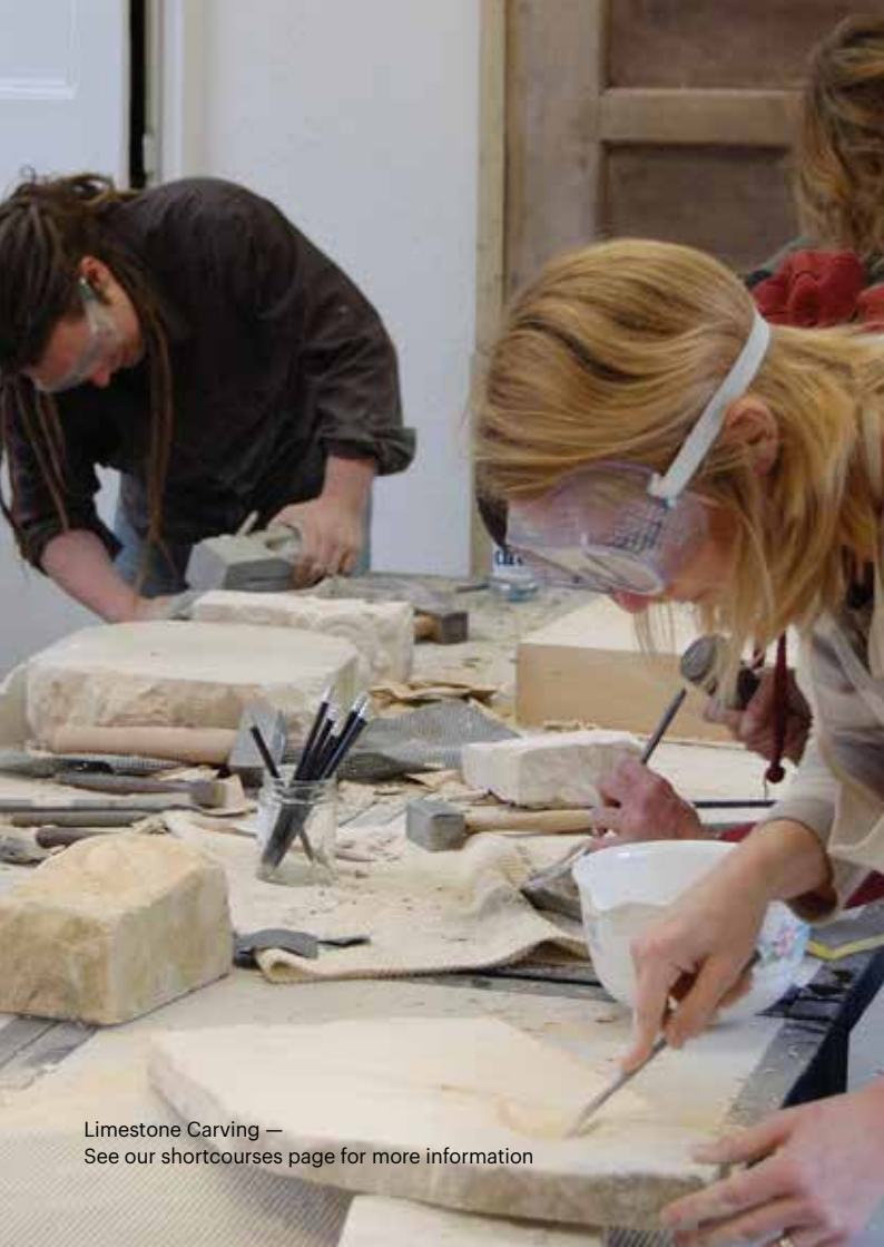
Limestone Carving — See our shortcourses page for more information

The National Centre for Craft & Design offers an exciting programme for children, young people, adults, families and community groups to explore the content and themes of our exhibitions. This season we have talks, workshops, clubs, short-courses, demonstration days and summer holiday workshops to inspire new learning.